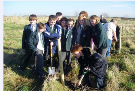
Pupils from Castle View School and Winter Gardens Junior school help to plant some of the 1500 trees at Tewkes Creek