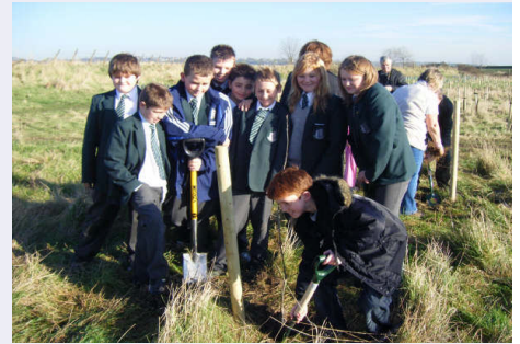
Pupils from Castle View School and Winter Gardens Junior school help to plant some of the 1500 trees at Tewkes Creek